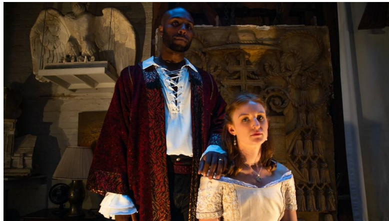
Othello at Casa Clara in New York City.

Wednesday Matinee... See Othello produced by New Place Players at Casa Clara in New York City. Products by City Theatrical include Multiverse® SHoW Baby® wireless DMX/RDM, DMXcat® Multi Function Test Tool , Safer Sidearms™ , Standard Top Hats , Sandwich Holders , C-Clip Truss Protector , and Blacktak™ Light Mask Foil .