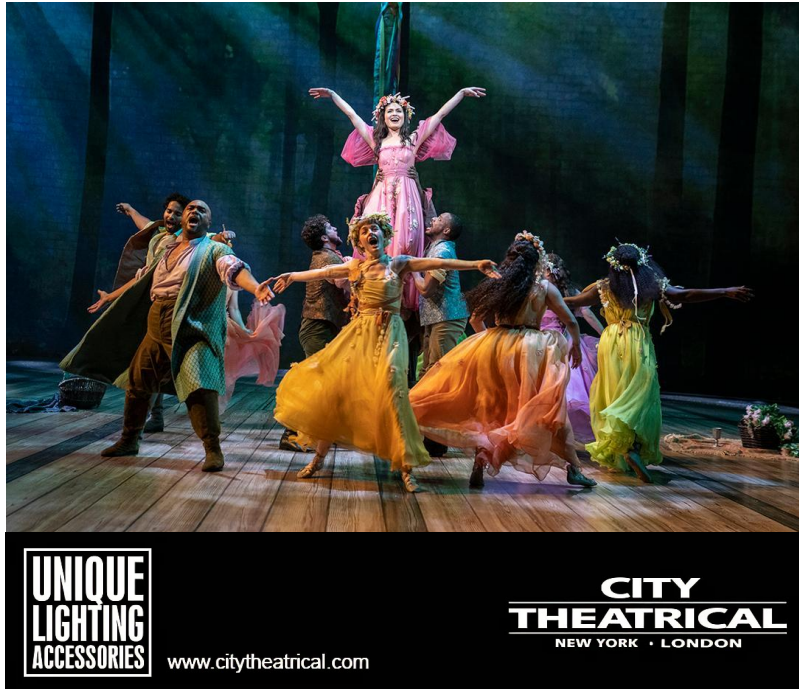
Phillipa Soo (center) and the company of Camelot