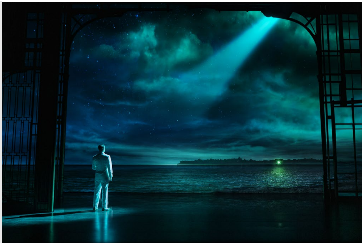
Jeremy Jordan as Jay Gatsby in The Great Gatsby

Wednesday Matinee... See The Great Gatsby at The Broadway Theatre in New York City. Products by City Theatrical include Multiverse® Transmitters , Multiverse Nodes , QolorFLEX® 25x3A Dimmers , Environmental Lights RGBWW 4-in-1 5050 CurrentControl LED Strip Light , Standard Top Hats , Short Top Hats , GLP X4 Concentric Rings , Martin MAC Viper Wash DX Top Hats , Blacktak™ Light Mask Foil , and Safer Sidearms™ . Software used includes Moving Light Assistant™ .