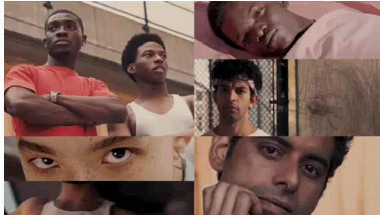
West Side Story on Broadway

Wednesday Matinee... see West Side Story at the Broadway Theatre in New York City . Products by City Theatrical include QolorFLEX® HiQ High CRI LED Tape , Standard Top Hats , Martin Top Hats for MAC Encore and Viper Performance, Martin Concentric Rings for MAC Quantum Wash, Safer Sidearms™ , and Blacktak™ Light Mask Foil . Lighting software used includes Lightwright® 6 , Moving Light Assistant™ , and Vectorworks Spotlight .