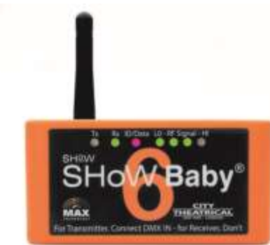
SHoW DMX SHoW Baby® 6 wireless DMX with Maximum Bandwidth Technology™ by City Theatrical