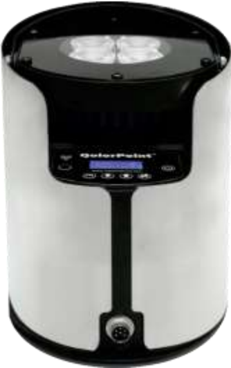
QolorPoint Wireless LED Uplighter by City Theatrical