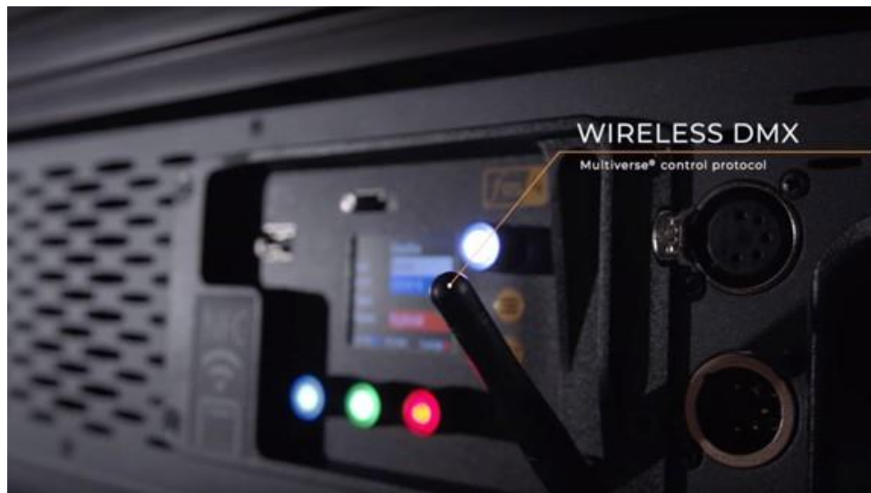
City Theatrical Multiverse wireless DMX/RDM technology comes onboard in various light fixtures by ETC, including the fos/4 Panel.