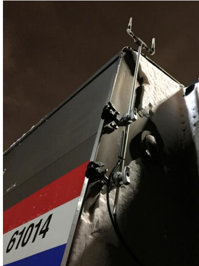
THE POLAR EXPRESS Train Ride of Chicago, Illinois uses City Theatrical's SHoW DMX SHoW Baby 6 products to transmit wireless DMX from the boarding platform to each train.