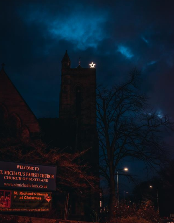
QolorFLEX NuNeon was selected as the LED lighting solution for the star installed above St Michael's Parish Church in Edinburgh, Scottland for its extreme flexibility and brightness, IP67 rating, and rugged reliability to withstand extreme outdoor environments.