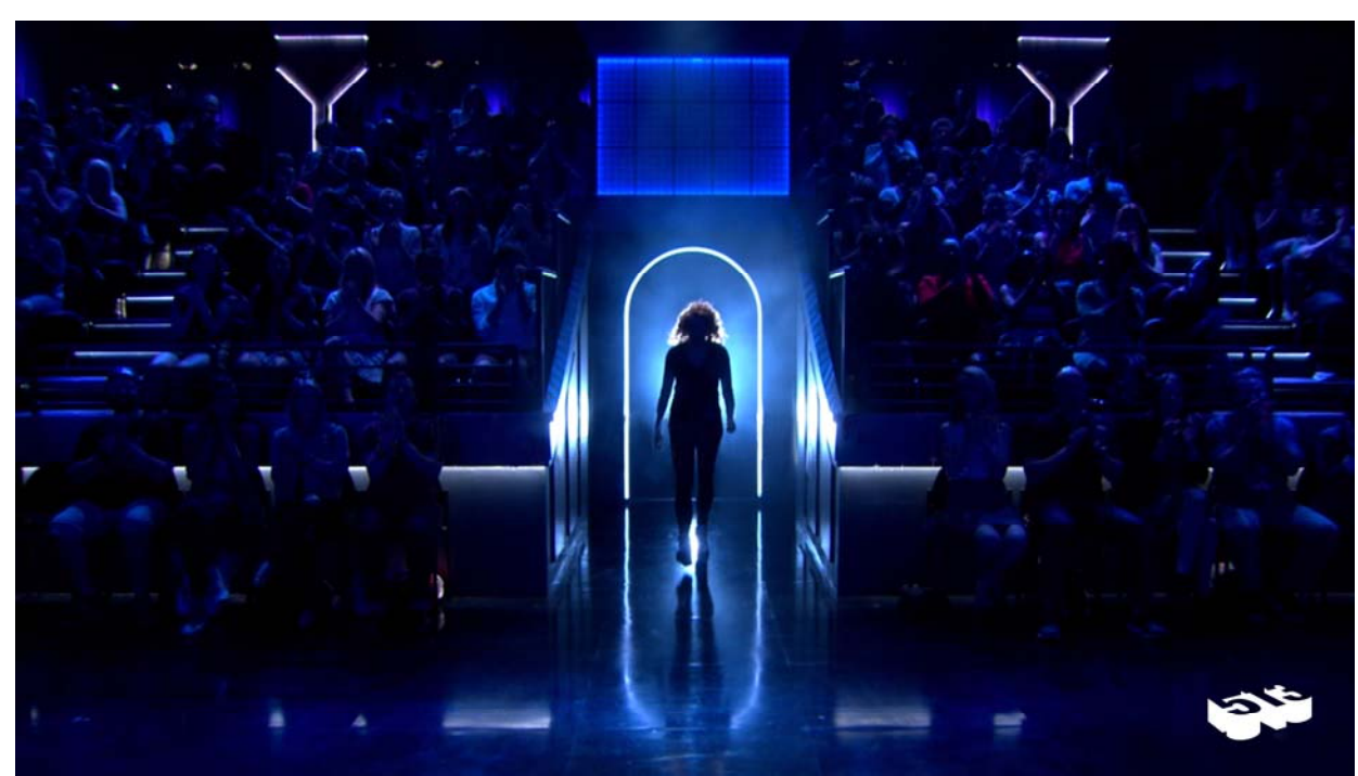
QolorFLEX NuNeon illuminates the archways on set at The Break with Michelle Wolf on Netflix.