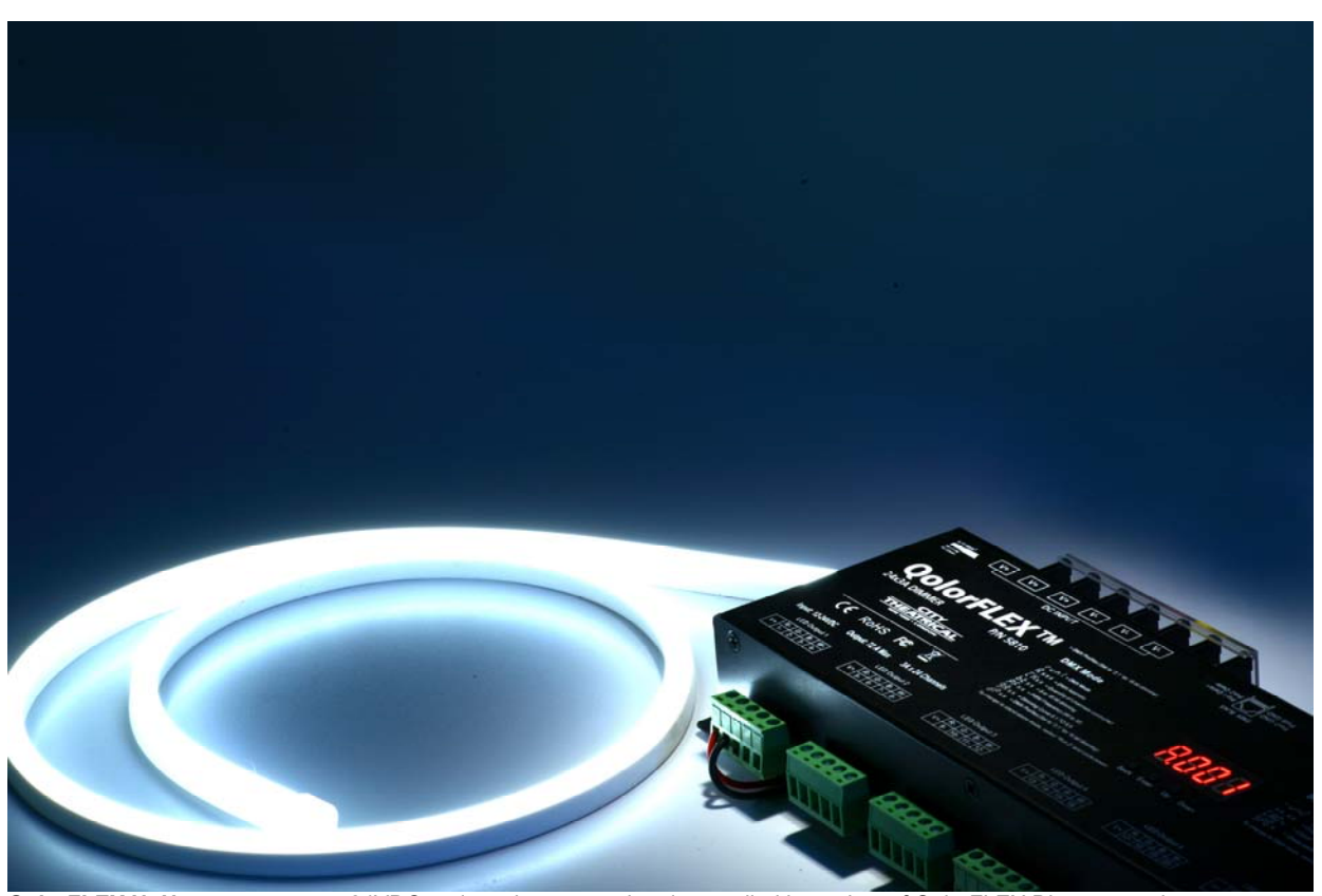
QolorFLEX NuNeon operates on 24VDC and can be powered and controlled by variety of QolorFLEX Dimmers and power supplies.

US HEADQUARTERS 475 BARELL AVENUE CARLSTADT, NEW JERSEY 07072 TEL 800 230 9497 / 201 549 1160 FAX 201 549 1161