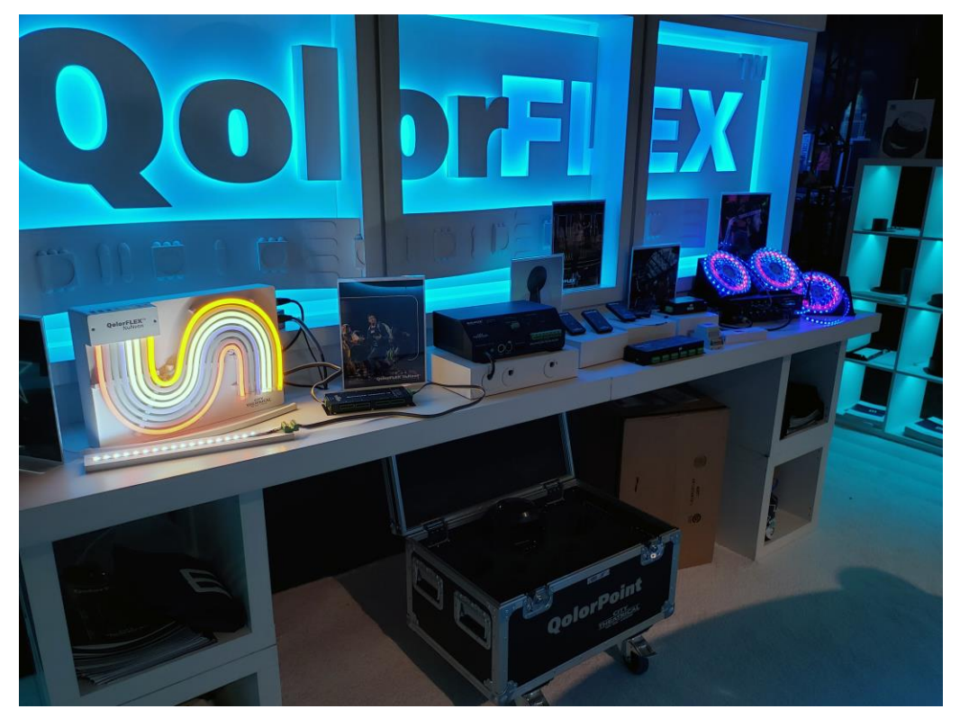
QolorFLEX<sup>®</sup> LED Tape, Dimmers, QolorFLEX NuNeon<sup>™</sup> and QolorPIX<sup>®</sup> will be on display at Prolight + Sound 2019.