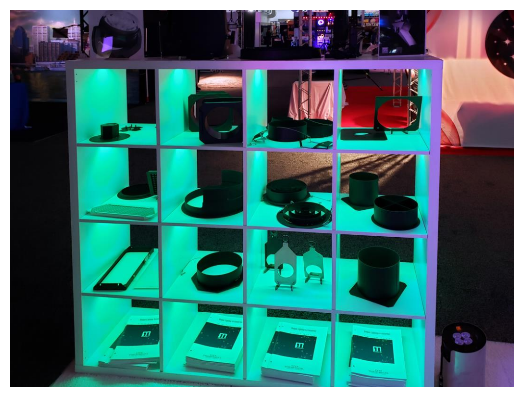
City Theatrical's vast array of beam control accessories will be on display at Prolight + Sound 2019.