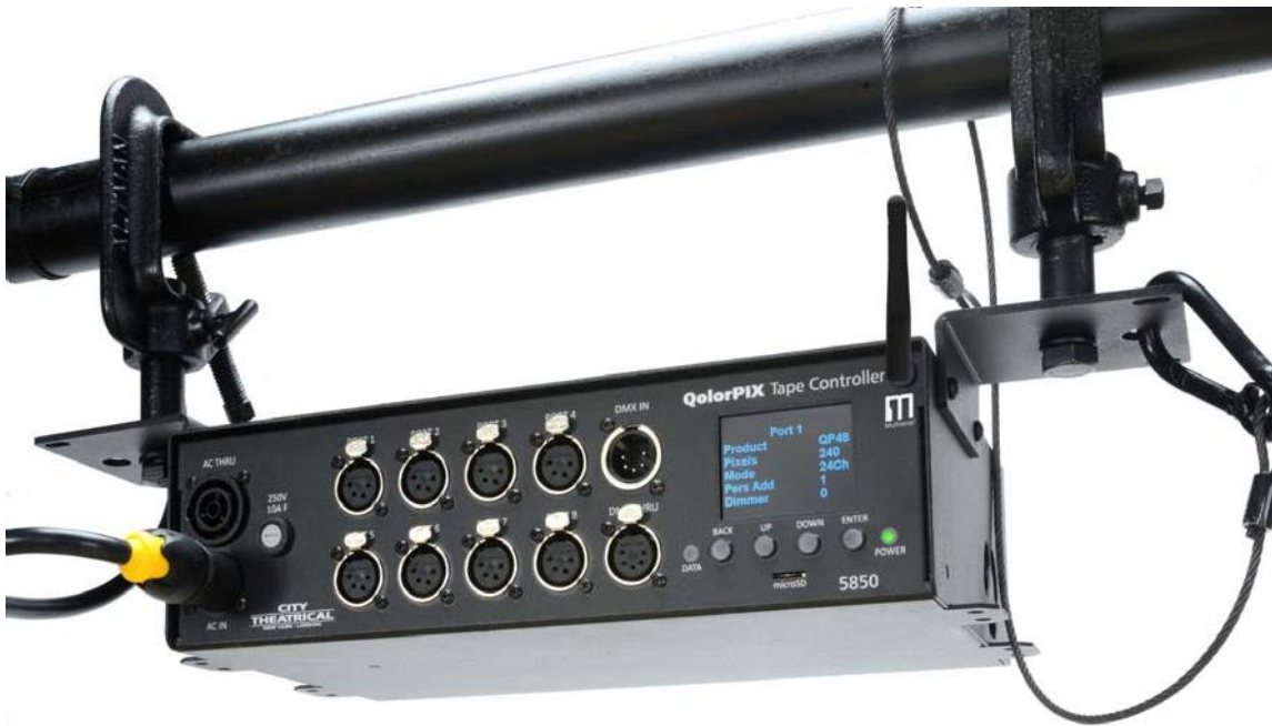
Figure 2: Pipe Mount