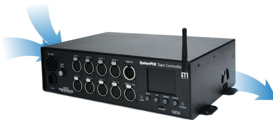
Figure 5: Air Flow