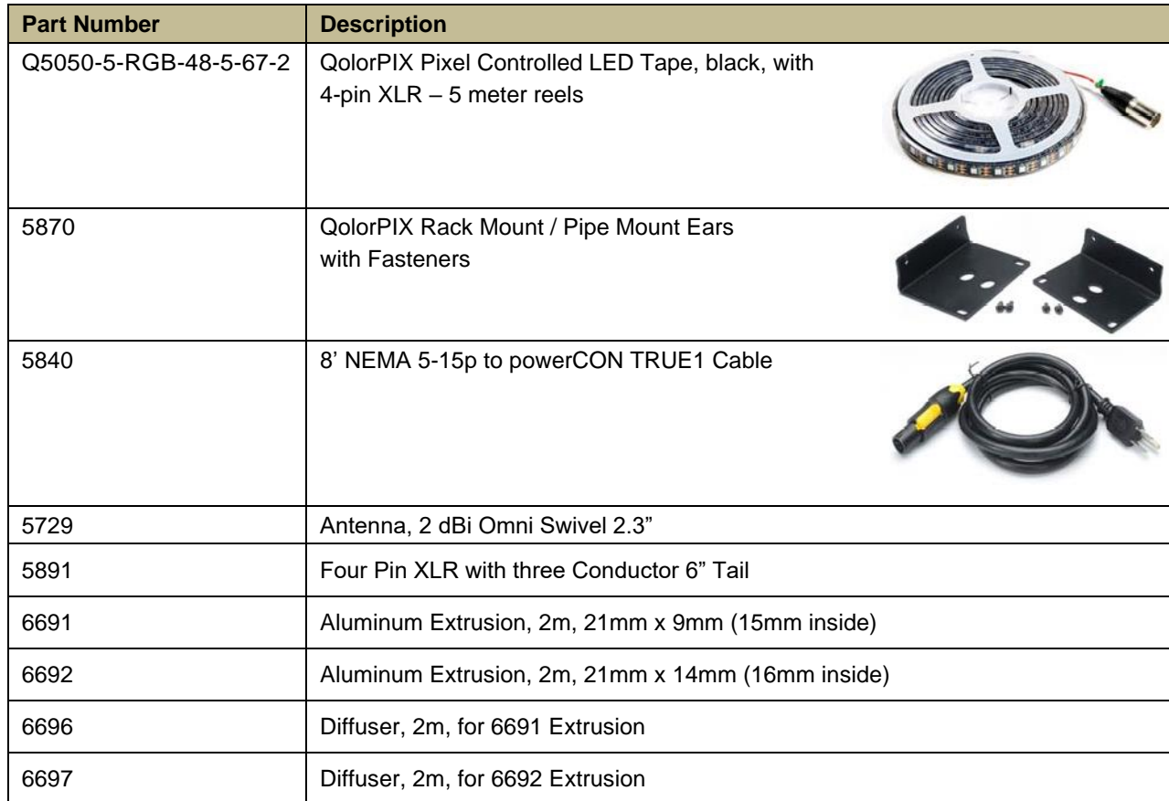
Table 5: Accessories