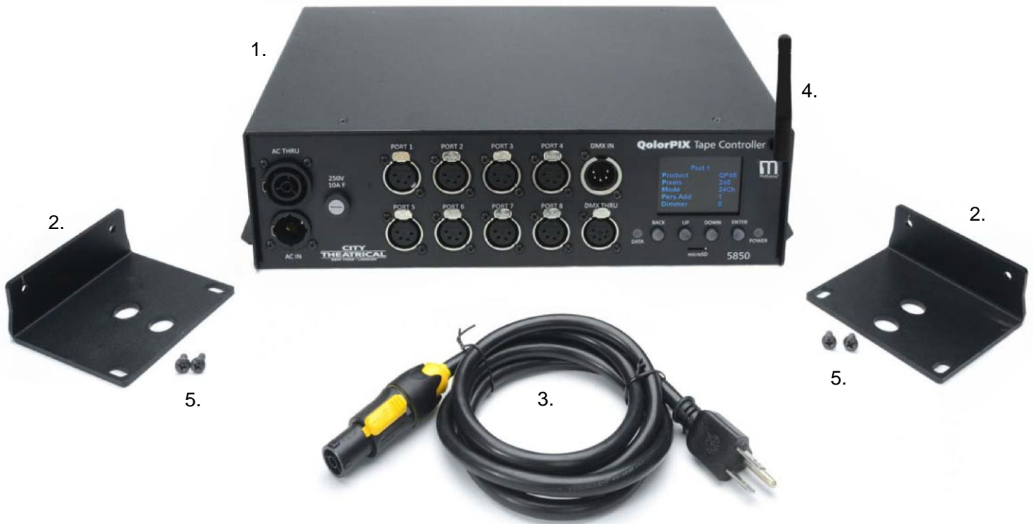
Figure 1: What's Included