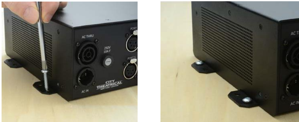
Figure 4: Surface Mount