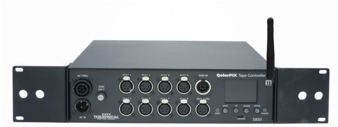
Figure 3: Rack Mount