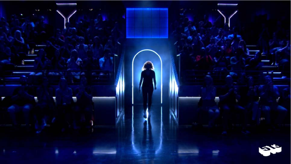
QolorFLEX NuNeon illuminates the archways on set at The Break with Michelle Wolf on Netflix.