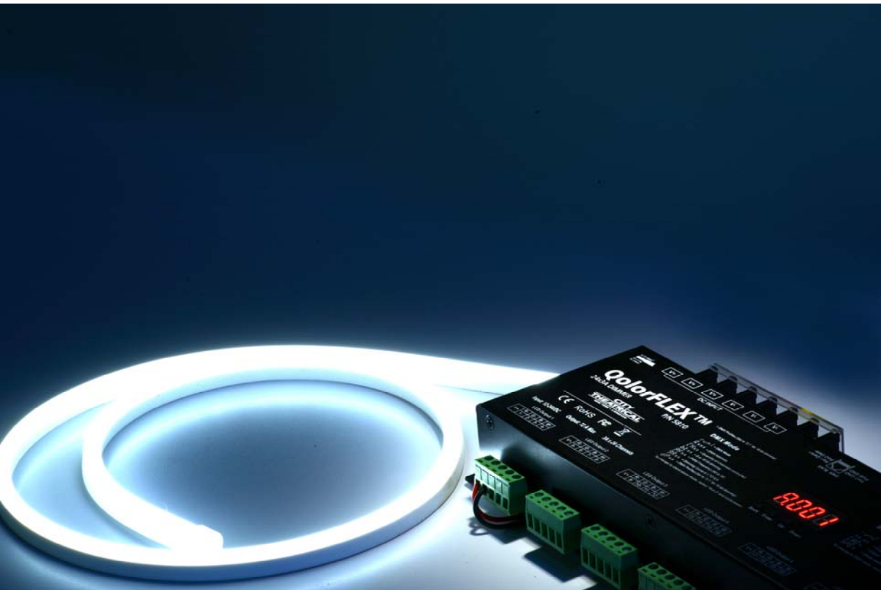
QolorFLEX NuNeon operates on 24VDC and can be powered and controlled by variety of QolorFLEX Dimmers and power supplies.

US HEADQUARTERS 475 BARELL AVENUE CARLSTADT, NEW JERSEY 07072 TEL 800 230 9497 / 201 549 1160 FAX 201 549 1161