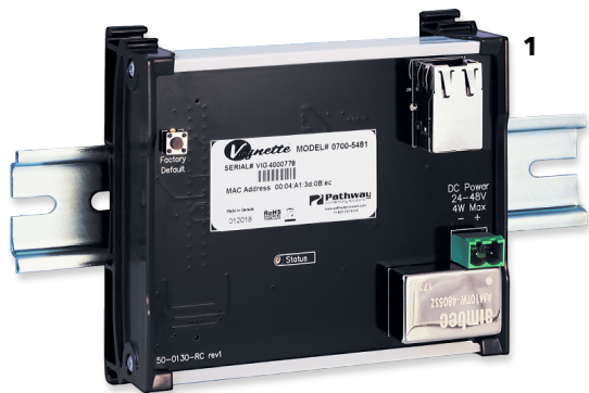
Models shown: 1. PWGW DIN CLK