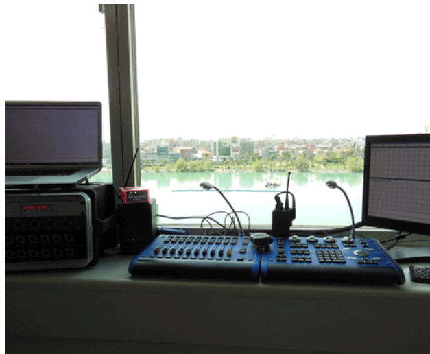
Programming station in the Hilton. Note the SHoW Baby to the left of the console transmitting to the targets in the river.