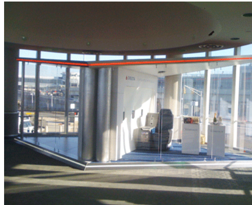
Finished installation at New York's JFK Airport