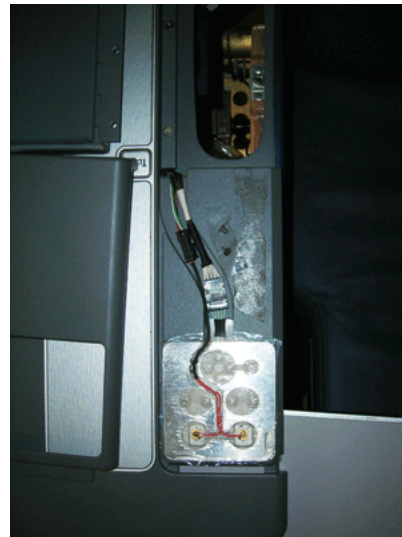
Seat modification detail with CTI microsurgery