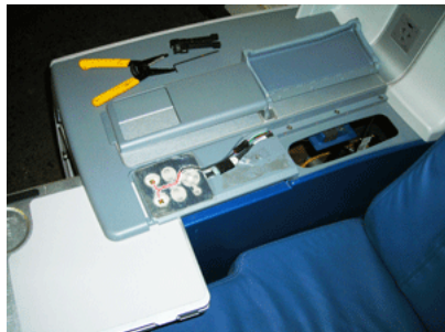
CTI mod of passenger controls