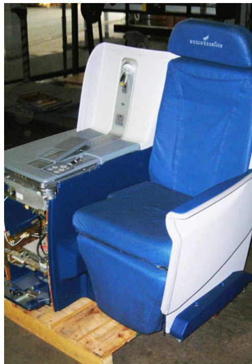
The Delta Business ELITE seat as delivered to CTI