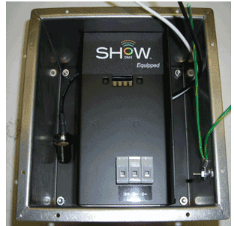
A custom ETL listed outdoor enclosure for SHoW DMX