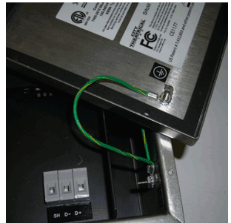
Custom box with ETL label applied