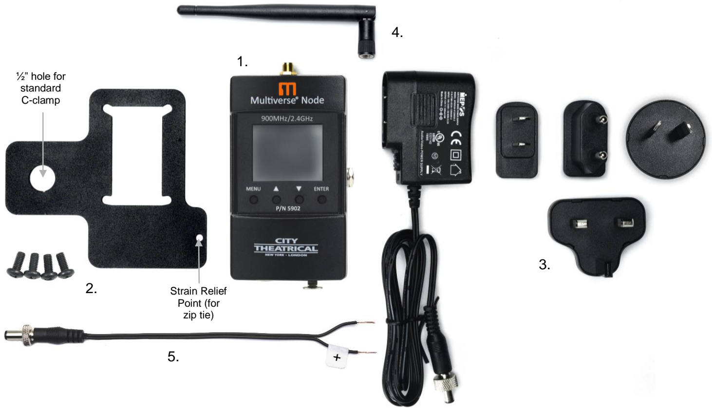
Figure 1: What's Included