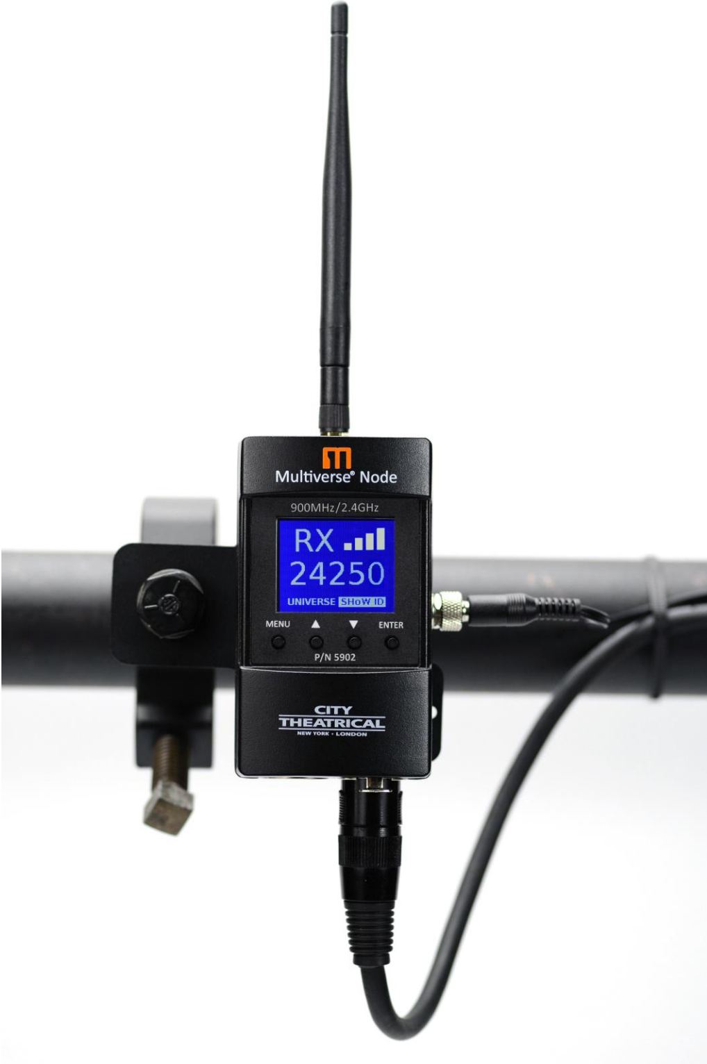
Figure 3: Pipe Mount