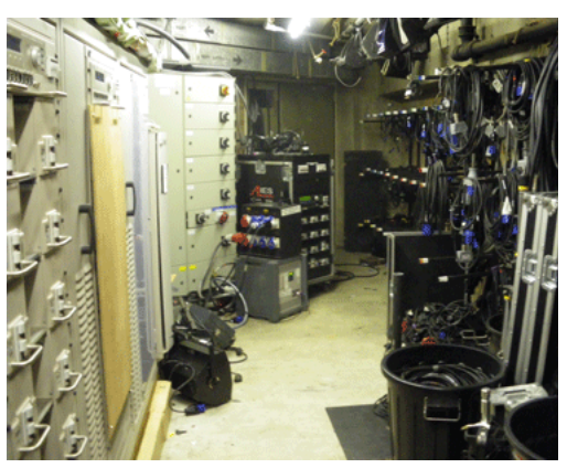
New IES dimmers being installed