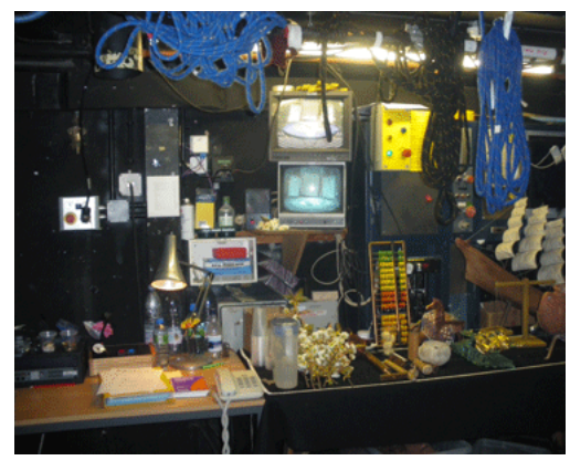
The prompt corner at the Olivier Theatre