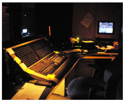
ETC Eos in the lighting booth

It's not something you want to make a career of because there are long and unsocial hours. People outside theatre never believe that. They don't believe that you can work 9AM to 11PM all day all week because you are putting on a new show. People don't do that outside theatre. It is a very difficult thing to do as a career and so I say to people that if they can, do something else as well, so they have a choice. I think that is a very good thing to have. So that when they get to be 35 and think I'm not sure about this and your family is missing you. That is my point. I know it is a negative one. The positives are the fact that you get to meet ameazing people. It is a creative career where you are doing amazing creative things. Lighting design is the cream on the top of the milk where you are painting pictures with light and it is the most enjoyable thing. You get to travel a lot. I've been to Moscow, Israel, Tokyo, all around America. It is great. Most jobs you never go abroad with. There are certainly plusses to what can happen. But if you are planning on getting married and having a family life, it is difficult as you get older. So I think it's best to have a safety net, to have an option or a "get out" clause.