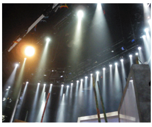
VL500s and VL1000s at the Olivier