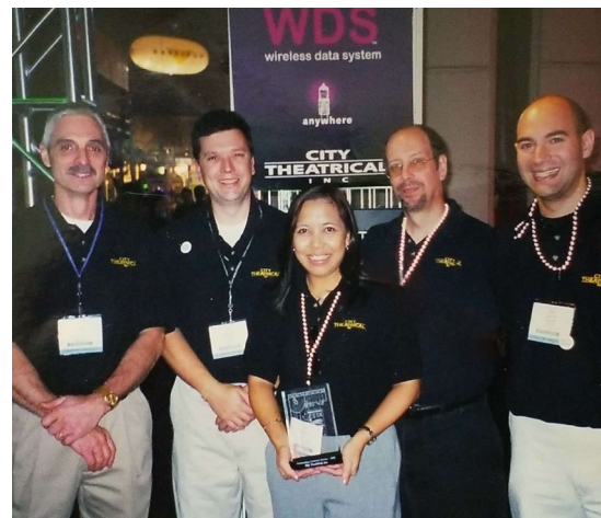
ESTA's Dealers' Choice Customer Service Awards at LDI 2005