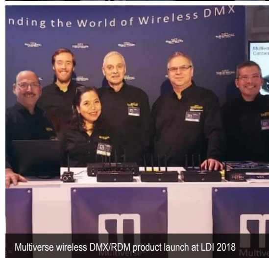
Multiverse wireless DMX/RDM product launch at LDI 2018