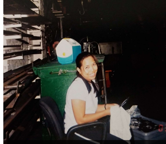
City Theatrical manufacturing in Bronx, New York facility in 2001

LS: Then and now, the culture has always been similar: Each person at City Theatrical is a valued team player. The culture is flexible and open to new ideas. The management is always trying to