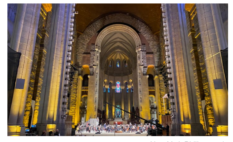
New York Philharmonic