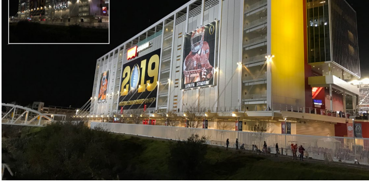
College Football Finals 2019, unlit (left) vs. lit (right)