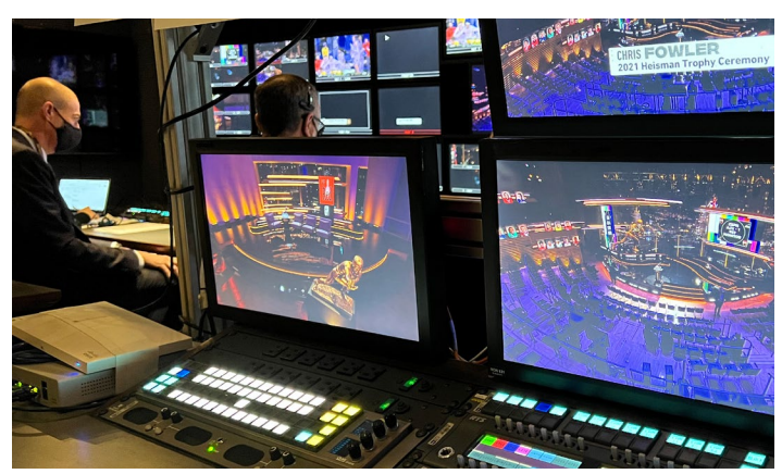
Heisman Trophy TV Truck