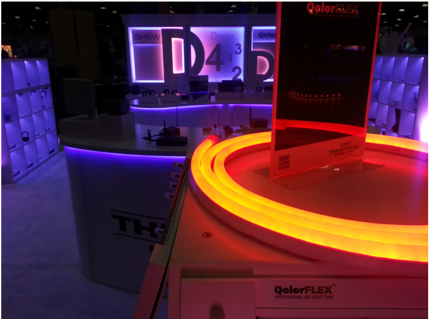
NuNeon is a flexible, color changing, replacement for neon. It's bright and easy to work with.