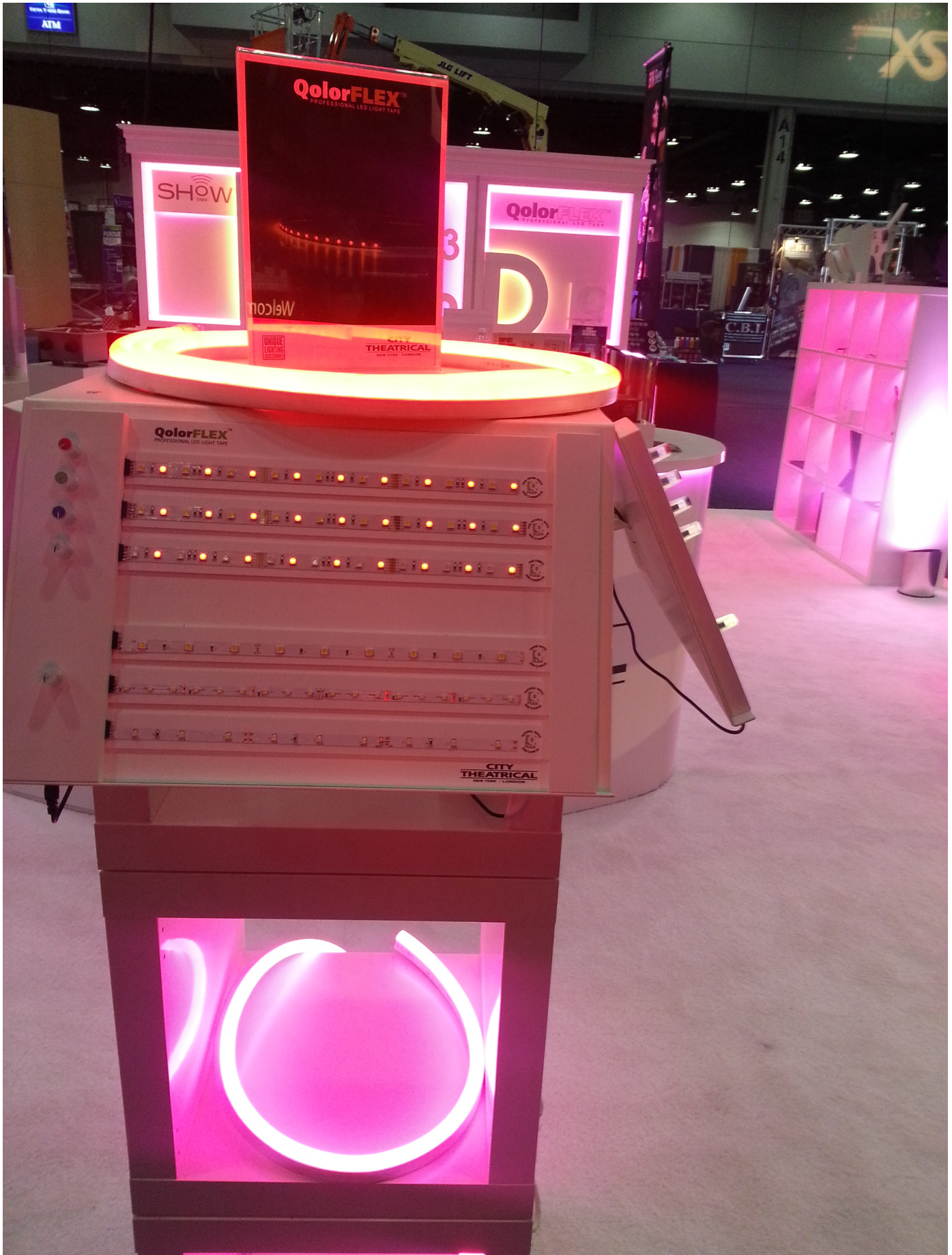
The kiosk in front is a place for designers to test different combinations and intensities of our QolorFLEX LED Tape.