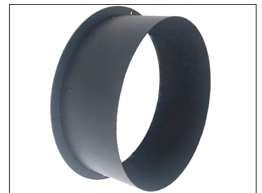
2820 - Martin ERA 800 Performance Top Hat