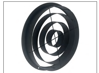
2821 - Martin ERA 800 Concentric Ring