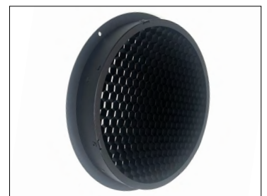
2822 - Martin ERA 800 Hexcel Louver