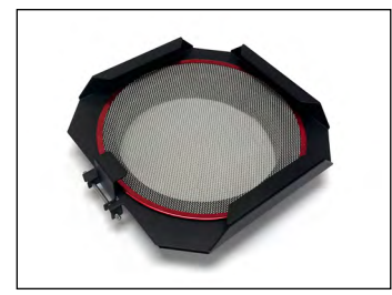
Adapter holding one scrim

City Theatrical Adapters can extend the use of your stock, and save you money. Find out more about this and other Adapter solutions on our website.