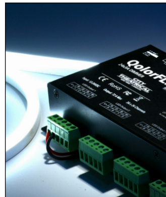
QolorFLEX 24x3A Dimmer shown controlling QolorFLEX LED Tape (left) and QolorFLEX NuNeon® (right).