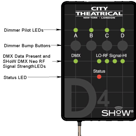
SHoW DMX Neo D4 Dimmer, Front View