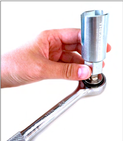
Wing Nut Socket attaching to a 3/8" ratchet with a push button..