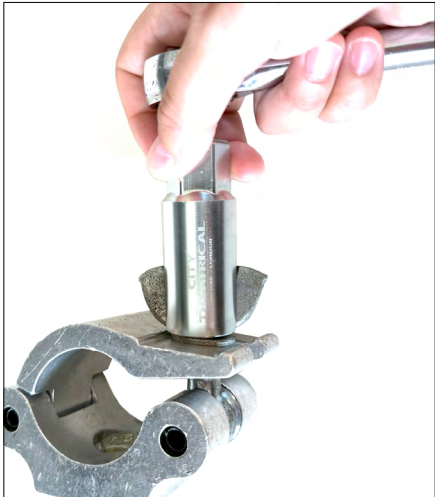
Wing Nut Socket slides over any wing nut.