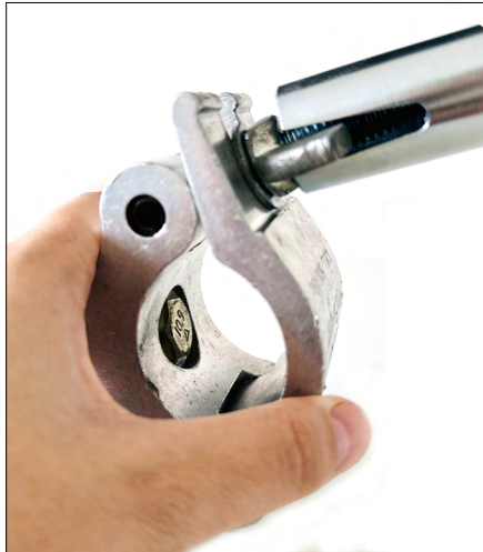
Wing Nut Socket tightens or loosens any wing nut with ease and reliability.