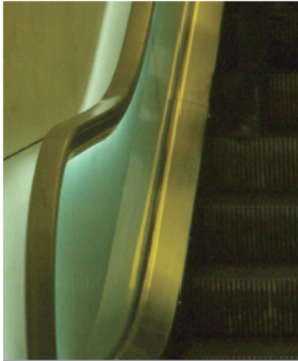
Hudson Hotel Escalator Lighting Design: Philippe Starck Lit With: QolorFLEX™ NuNeon