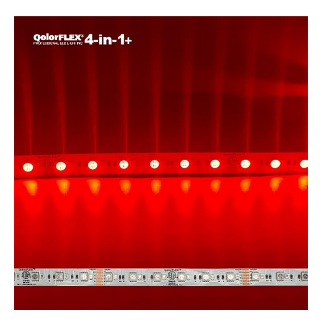
City Theatrical's QolorFLEX Quad Chip RGB Amber Plus Deep Red LED Tape is the ideal LED tape for lighting designers looking for a true deep red color.