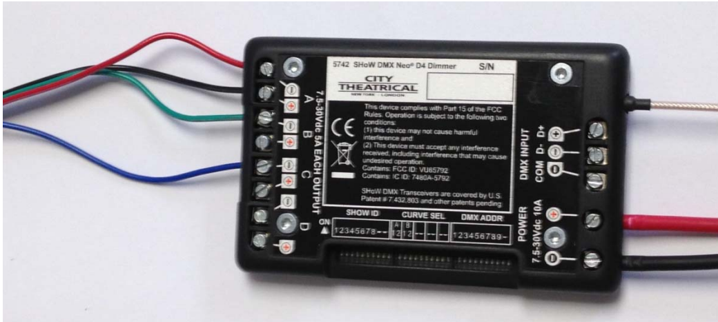
D4 Dimmer connected to RGB Tape