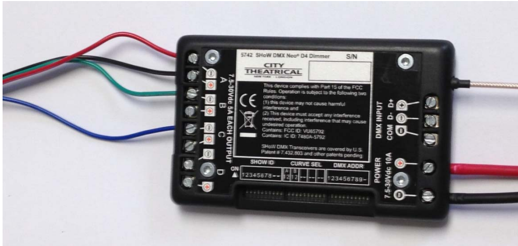
QolorFLEX SHoW DMX Neo 4x2.5A Dimmer connected to RGB Tape