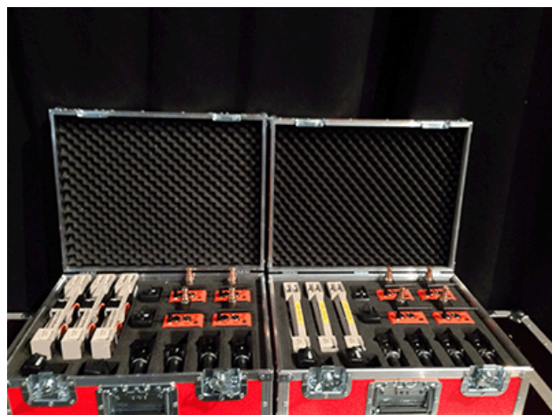
Flight cases for SHoW Babys