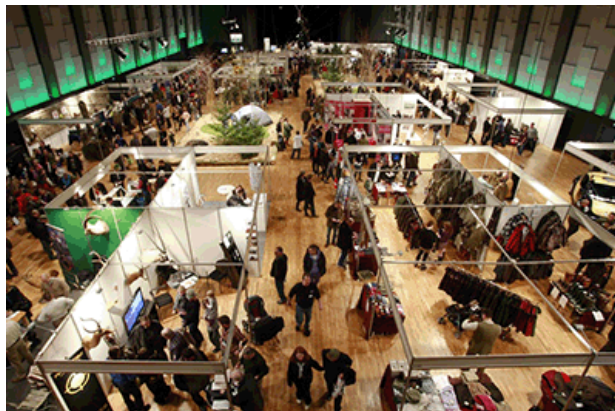
AKKC venue in use