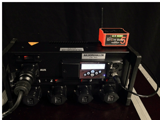
SHoW Babys controlling ETC dimmers