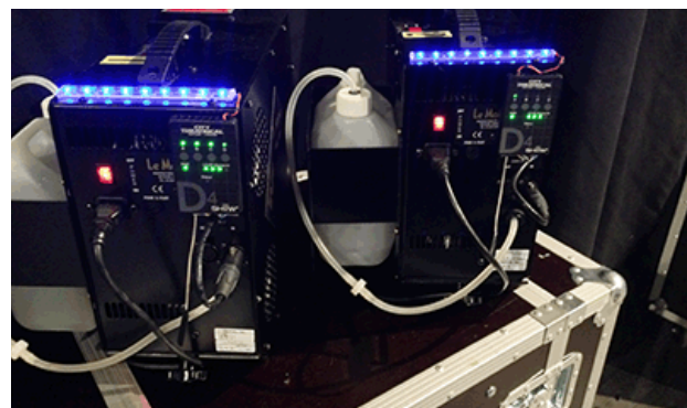
D4 Neo Dimmer controlling LED tape on a hazer, used as a warning light for performers