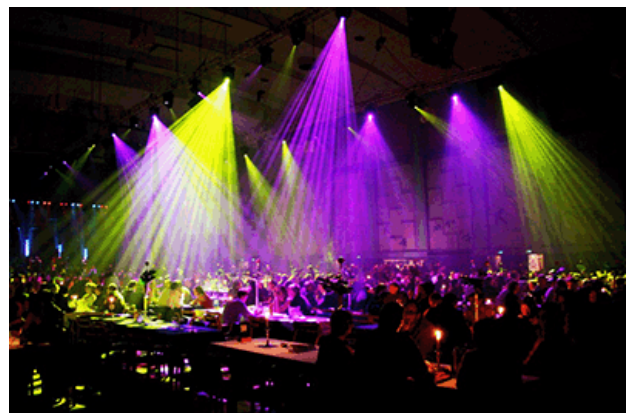
AKKC venue in use