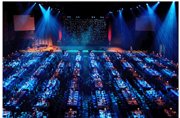
AKKC venue in use

We have had conferences with 2,000 laptops turned on and connected to wi-fi internet. At the same time we used 10 SHoW Babys working over two universes, each packed with around 400 channels. Another time we ran three wireless universes packed with moving heads. It was 10 Babys and two D4s, without any dropouts or flicker!