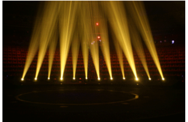
The incredibly beautiful design in action