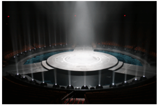
The full Beach Rail surrounding the pool