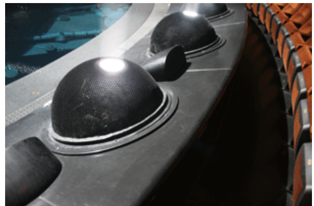
The "Beach Rail" utilizes 36 VL3500s under waterproof domes covered with black louver to make the lights disappear when not on, and to minimize distractions with they are on.