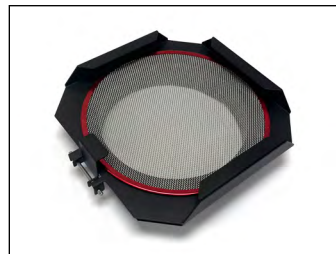
Adapter holding one scrim

City Theatrical Adapters can extend the use of your stock, and save you money. Find out more about this and other Adapter solutions on our website.