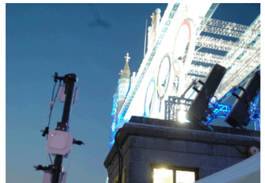
Outdoor panel antennas