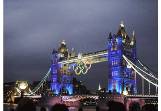
Night view of Tower Bridge lighting

WW: From building the transceivers into our control data racks and testing the system in the workshop, SHoW DMX was easy to use and orientated to plug and play, but going further into its bandwidth options there was a lot of room to optimise the system to a specific show.