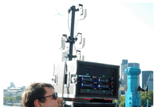
Antenna tower next to Tranceivers