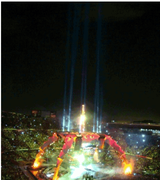
View from the top of the stadium