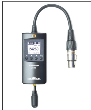
Standard antenna for Multiverse Studio Receiver

The Multiverse Studio Receiver’s Dual Band Antenna allows the user to receive a single universe on the 2.4GHz (for worldwide use) radio band or the 900MHz (for use in the Americas only) radio band.