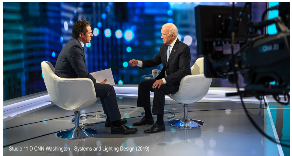
Studio 11 D CNN Washington - Systems and Lighting Design (2019)