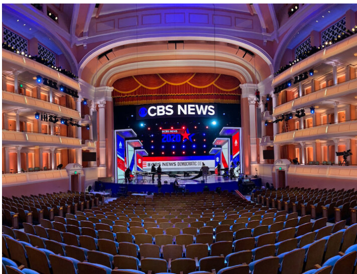
CBS Democratic Debate in Charleston, South Carolina (February 2020)

MP: Opryland Productions, which became TNN, The Nashville Network, had started doing network TV award shows, specials for ABC and CBS,