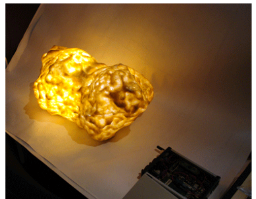
Das Rheingold Golden Nugget (running) next to a Receiver/Body Pa