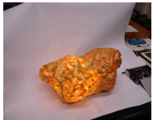
Das Rheingold Golden Nugget (running) next to a Receiver/Body Pa