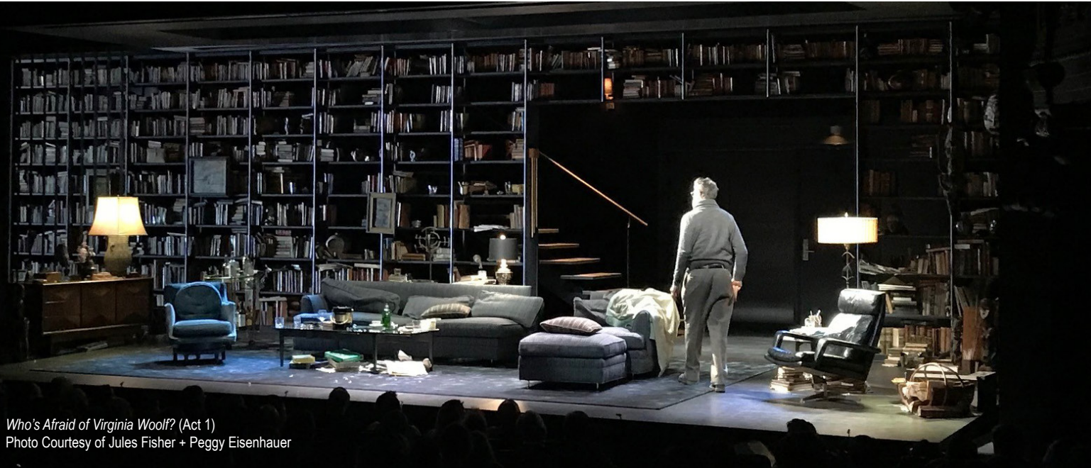
Who's Afraid of Virginia Woolf? (Act 1)