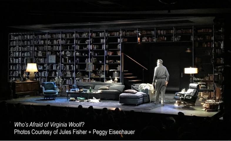
Who's Afraid of Virginia Woolf?