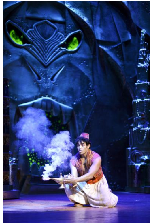
Disney's Broadway Aladdin star Adam Jacobs.

City Theatrical has provided the benchmark in wireless DMX systems for architecture and entertainment. Nearly 100% of Broadway and West End shows that use wireless DMX use City Theatrical's SHoW DMX Neo as well as large music tours, and permanent installations around the world. Lighting professionals trust City Theatrical and SHoW DMX Neo for their wireless DMX needs.